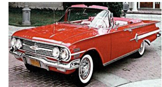
1960s car (The last Green Book was published in 1966)

• What differences do you see in design?