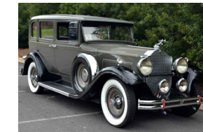
1930s car (the Green Book was first published in 1936)

The Green Book was published for a 30-year time period. Look at the cars in the exhibit.